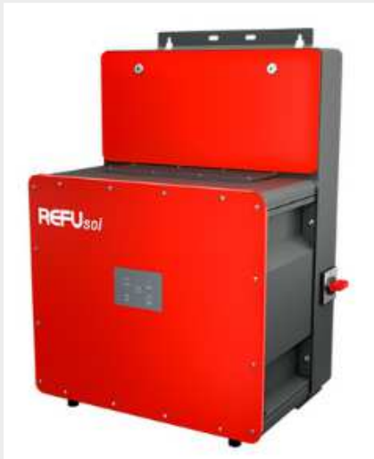
Decentral Connection Box with 2*20 DC fuses