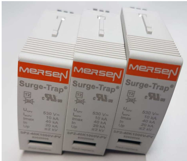
DC SPD Cartridge