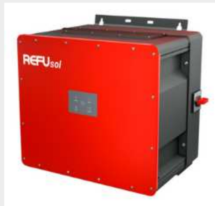
Central Connection Box only DC bold terminals